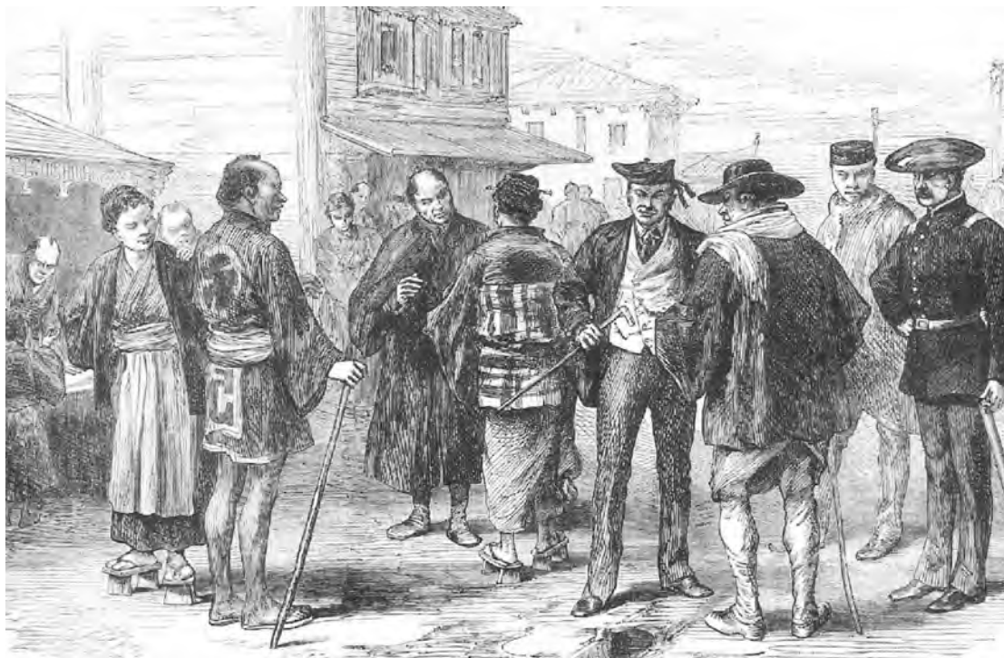
Japanese people wearing traditional and western costumes in 1873.

3 Look at the illustration, and then answer the questions which follow.