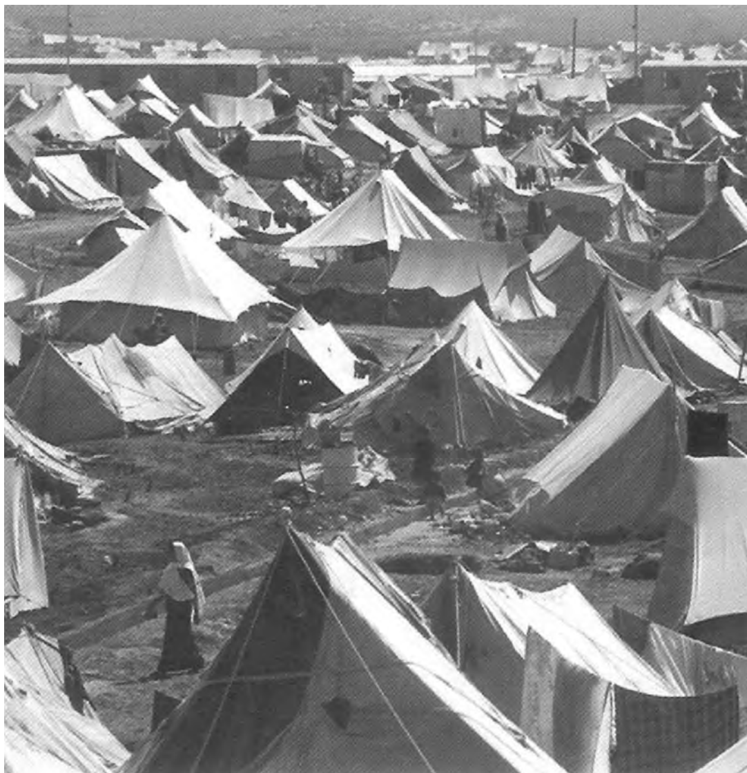
A photograph of a Palestinian refugee camp in Jordan, 1949.

21 Look at the photograph, and then answer the questions which follow.